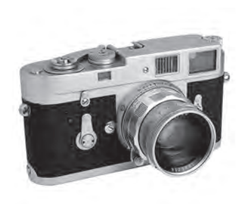
5 a camera / a phone