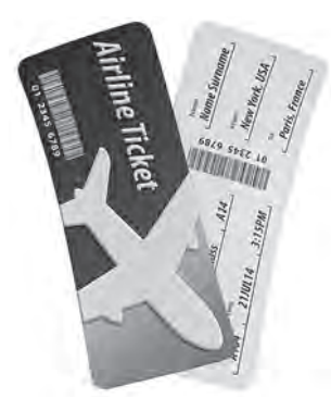
3 a passport / a ticket