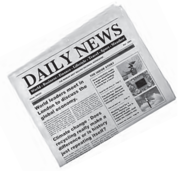
1 a map / <u>a newspaper</u>