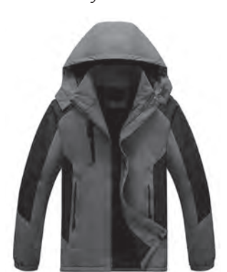
4 a coat / a bag